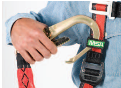
Positionable lanyard clip