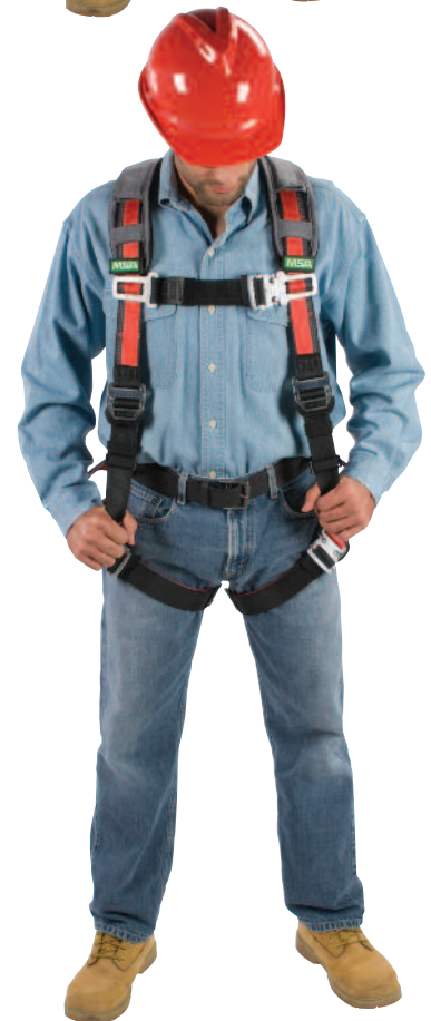
Patent-pending single-hand torso adjustment buckles simplify harness adjustment