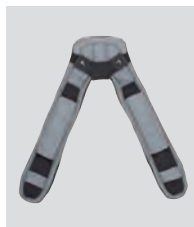
EvoTech Shoulder Pads Part No. 10111358