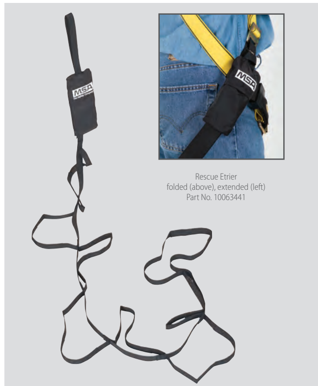
Rescue Etrier folded (above), extended (left) Part No. 10063441

Suspension Trauma Safety Steps allows workers to relieve pressure by inserting a foot into the step loops and then standing up in the harness to increase blood flow to the legs.