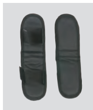
Shoulder Pads Part No. 10077489