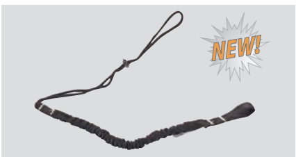
Tool Lanyard Part No. 10110670