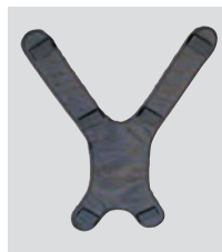
Shoulder Pad Part No. 10028444

MSA Harness Accessories maximize user comfort and allow customization of harnesses.